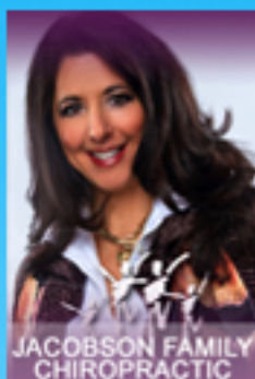
JACOBSON FAMILY CHIROPRACTIC