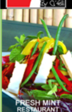
FRESH MINT RESTAURANT