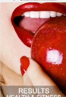
RESULTS HEALTH & FITNESS

Visit any one of the 4 Paris Paris locations and tell them Healthy U sent you and receive $50 off a purchase of $200 or more. Learn more about Paris Paris and their locations by visiting www.ParisParisAZ.com